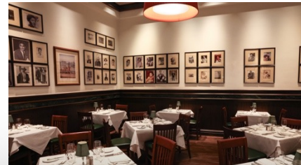
semi-private dining Room B