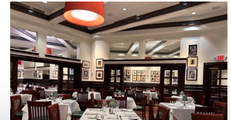
private dining room (dedicated separate bar & entrance)