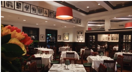
main dining room