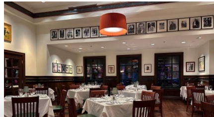
semi-private dining Room A